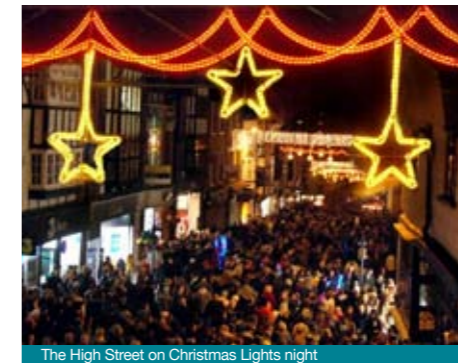
The High Street on Christmas Lights night

The lights will be switched on at 7pm and will be followed by further attractions including The White Lion Walk Shopping Centre's spectacular fireworks display.