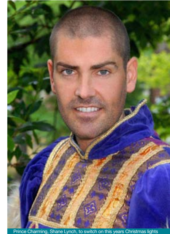
Prince Charming, Shane Lynch, to switch on this years Christmas lights

Don't miss out on one of the truly special events in the Guildford calendar.