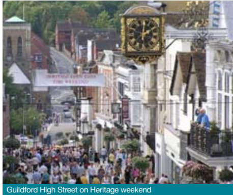
Guildford High Street on Heritage weekend

Many of the boroughs most interesting properties were opened free of charge to the public for the annual Heritage Open Days weekend from Friday 10 September to Sunday 12 September.