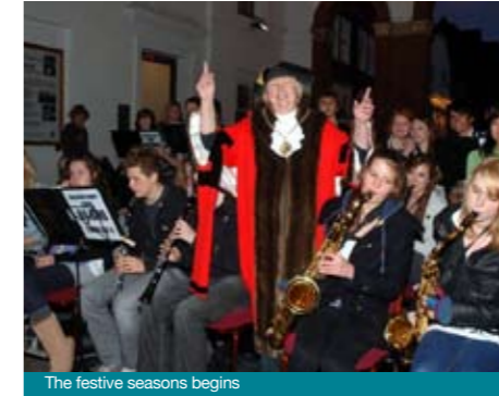
The festive seasons begins

Christmas in Guildford officially begins on Thursday 18th November when the town's Christmas Lights will be switched on by Boyzone star Shane Lynch.