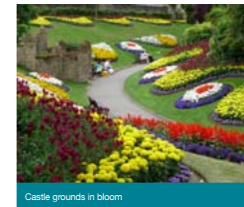
Castle grounds in bloom

Six of Guildford's parks have won Green Flag Awards - ranked among the best green spaces in the country. Stoke Park, Sutherland Memorial Park (Burpham), the Castle Grounds, Allen House Grounds, Guildford Crematorium grounds and Riverside Nature Reserve was recognised with an award. For more information visit www.greenflagaward.org.uk