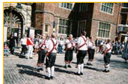
Pilgrim Morris Men