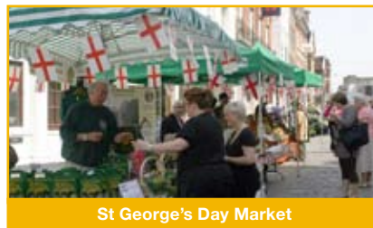
St George's Day Market