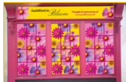
Mock up of New Heights store