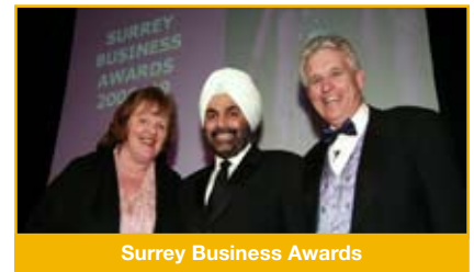
Surrey Business Awards