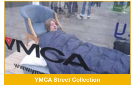
YMCA Street Collection

Congratulations to Naked Nutrition and all at Angel Gate for their successful 'Naked Night' late night shopping event which took place on Thursday 30 April.