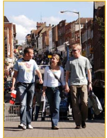
High Street Shoppers