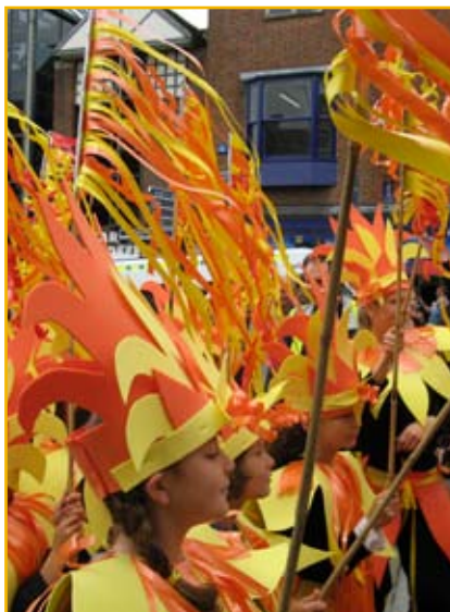
Festival Procession 2008

Centre with a carnival inspired procession running from the Castle Grounds from 12.30pm to Shalford Park. This year's theme is endangered species, featuring a range of colourful costumes, giant carnival figures and lively samba beats!